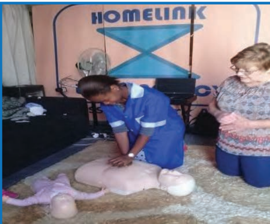
Our candidates have CPR and Firstaid training.