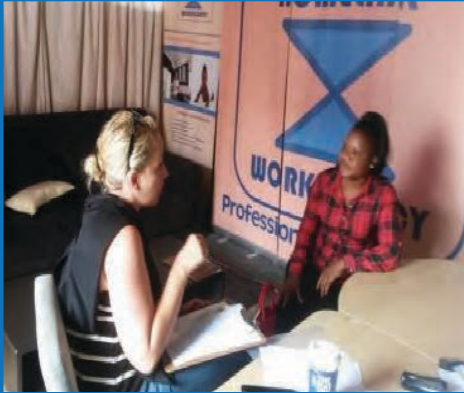
Client interview candidates