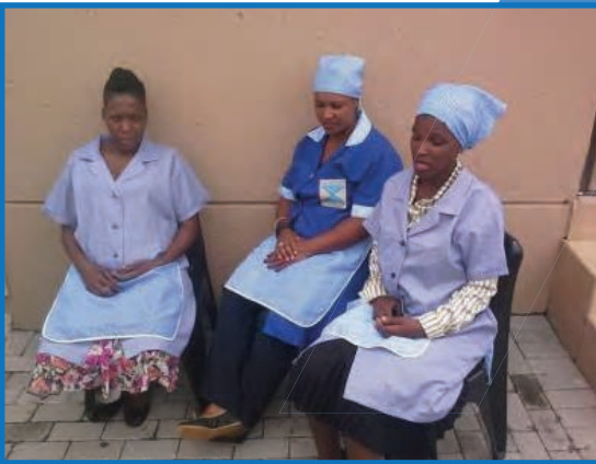
We give you more candidates for selection