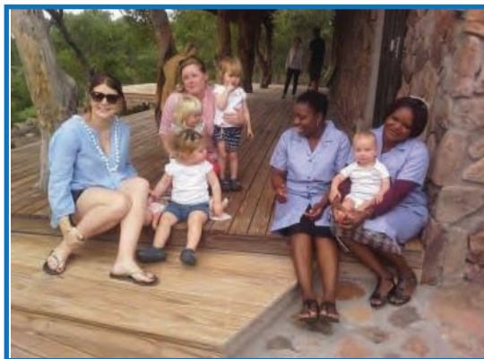
We serve with pride.

Homelix is situated at Gauteng, Centurion, strives to be a leading national recruitment & professional cleaning company.