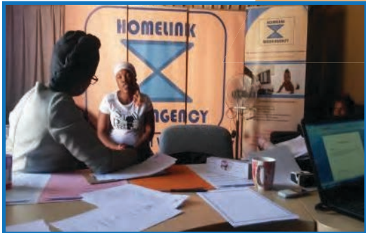
Client interview candidates