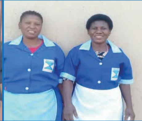
Our candidates are professional & presentable.

For more information feel free to contact us.