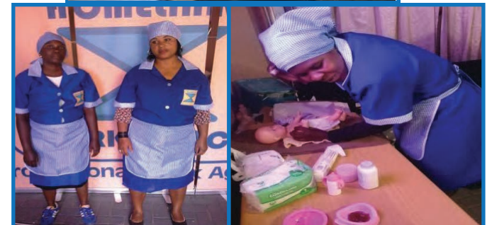
Our candidates are professional & presentable.