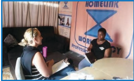
Client interview candidates