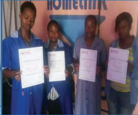
Our candidate are qualified