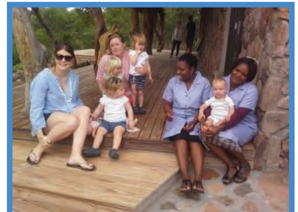
We serve with pride