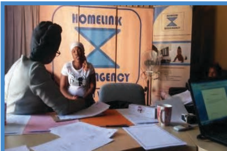
Client interview candidates